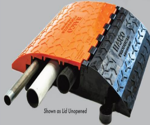
Shown as Lid Unopened